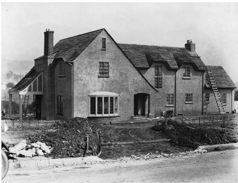
721 Berkshire Avenue (#6).