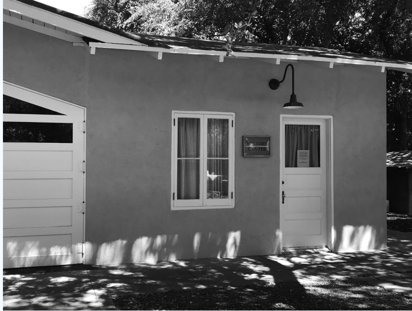
Membership dollars help support on-going preservation work to the Lanterman House, including the repair and repainting of the Visitor and History Center in 2020.

Since the dedication of the Lanterman Historical Museum Foundation in 1993, memberships have helped the Foundation raise money to pay for the continued preservation and restoration of the Lanterman House & Archives. We have accomplished great things in the past twenty-nine years and we are so grateful to all of our members for their support.