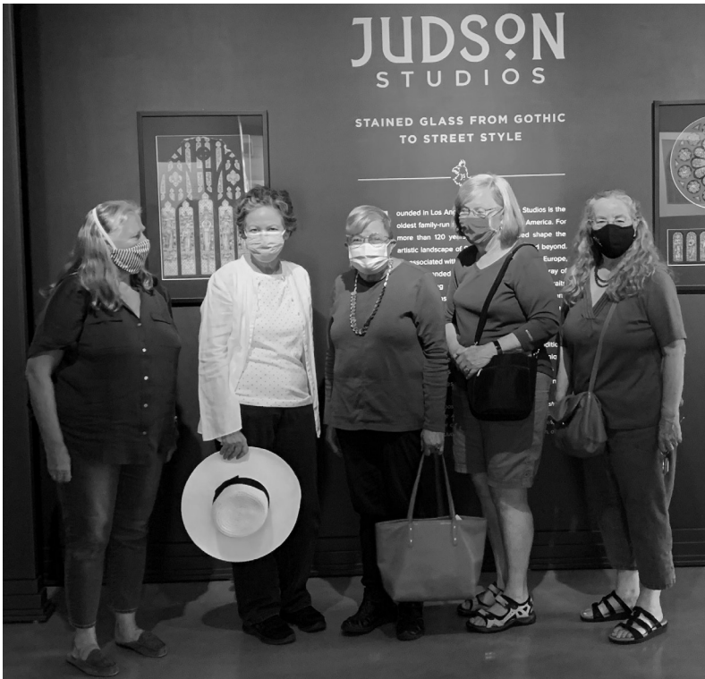
Lanterman House volunteers visited the Judson Studios exhibit at Forest Lawn Museum in September.