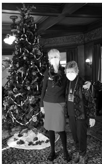
Volunteers gave brief tours of the festively decorated Lanterman House during the annual Holiday Open House.