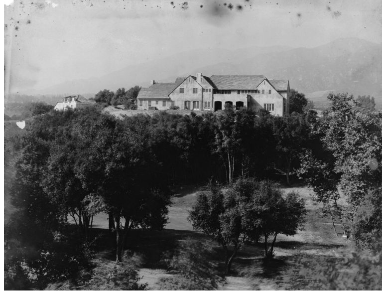
4236 Woodleigh Lane (#26). La Cañada Flintridge Historical Buildings Collection.