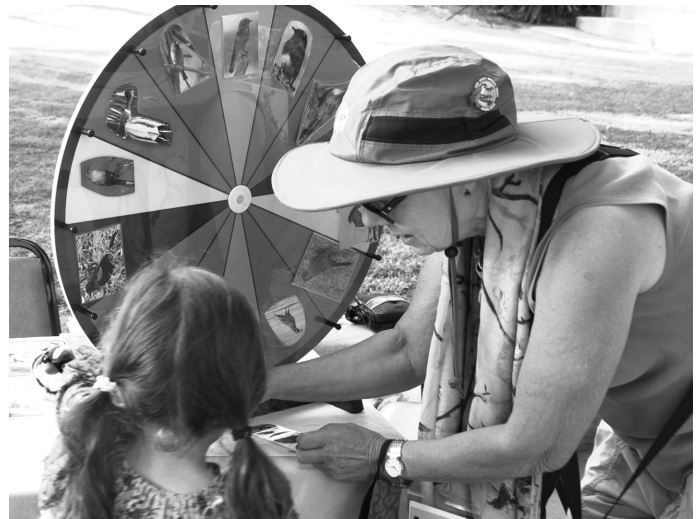
The Native Landscape event featured booths from several different local non-profits, including the Pasadena Audubon Society (shown here). Other booths included the Arroyo & Foothills Conservancy, the Arroyo Seco Foundation, the La Cañada Flintridge Trails Council, and the Theodore Payne Foundation. Hahamongna Native Plants Nursery and the Neshkinukat Native American Artist's Collective offered items for sale.