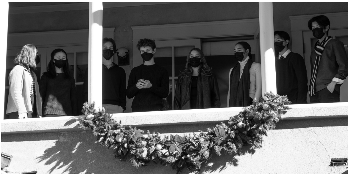
Members of the La Cañada High School Chamber Singers serenaded the crowd with holiday carols.

The Lanterman House held its annual Holiday Open House on December 19th, featuring carolers, a Gingerbread House contest, mulled cider, and a Holiday Boutique. The Cakery Bakery of La Cañada sponsored gift card prizes for all the Gingerbread House Contest winners.