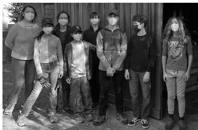
Members of Scout Troop 509 held a service day at the Lanterman House over the holiday break. Their project was to clean out the old Lanterman family shed and prepare it for more long-term storage upgrades. Thank you Scouts!