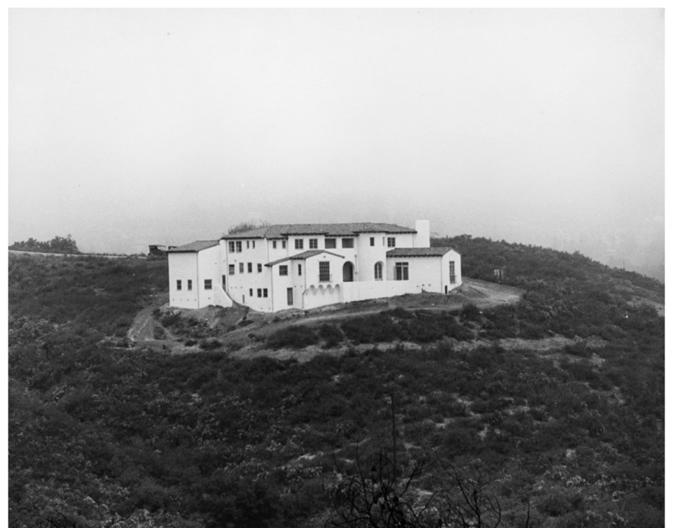
503 Dartmouth Place.