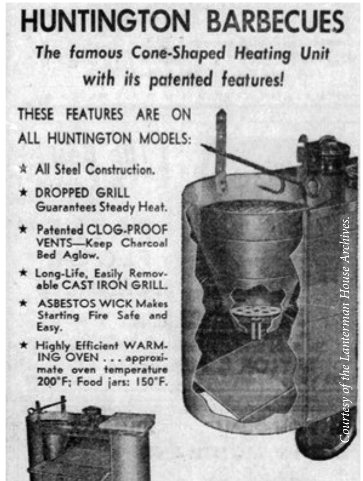
Advertisement for Huntington Barbecues, Valley Times, June 24, 1947.