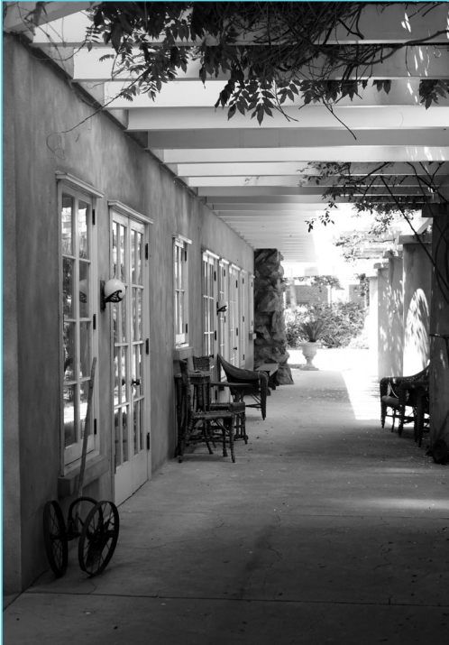
Under the pergola at Lanterman House.

If you are interested in taking a tour, please make a reservation on https://lantermanhousetour.eventbrite.com . Tours are offered on Tuesdays, Thursdays, and the 1st and 3rd Sunday of the month at 1pm and 2:30pm.