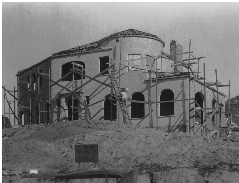
3718 Chevy Chase Drive (#9).

Spanish Colonial style home built in 1927 by the Flintridge Properties Company.