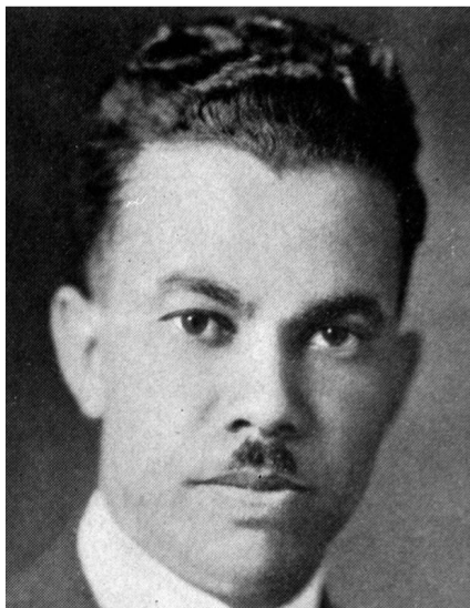
Paul R. Williams.

Do you know of another Paul Williams home in the area? Or have photos of any of these addresses that you'd like to donate to the Lanterman Archives? Please contact us at lantermanarchives@gmail.com .