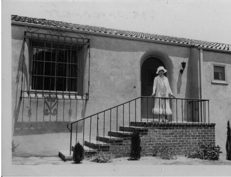
609 Inverness Drive (#19). La Cañada Flintridge Historical Buildings Collection.