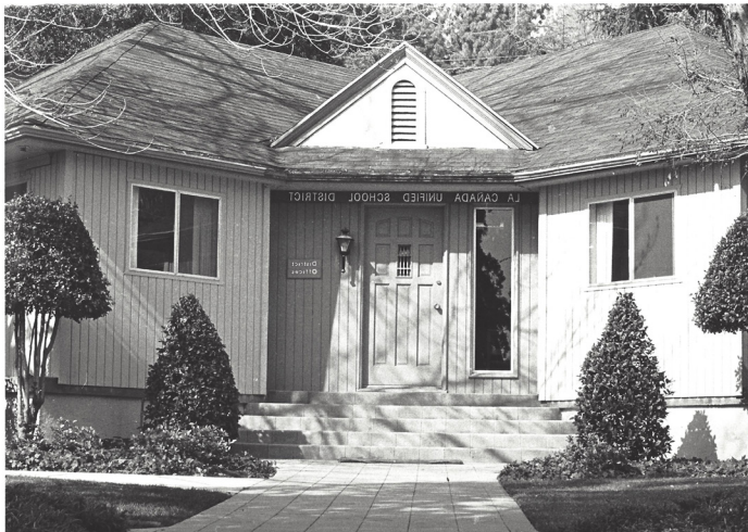
LCUSD Headquarters on 5039 Palm Drive, Circa 1955.

The house was used as the headquarters of the school district until 2005 when new offices were built at 4490 Cornishon. After that, the house was mostly used for storage. During the past decade, the school district announced plans to demolish the house to make way for a parking lot, and the house was torn down in 2021.