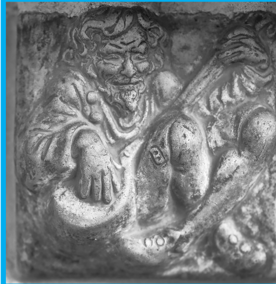
The Lute Player, one of the four musician tiles from the Batchelder fireplace which was carefully removed from Viewpoint.