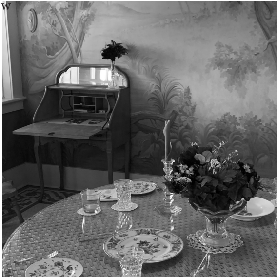
In the breakfast room of the Lanterman House.

Please be sure to check the Lanterman House website at www.lantermanhouse.org for the most recent information.