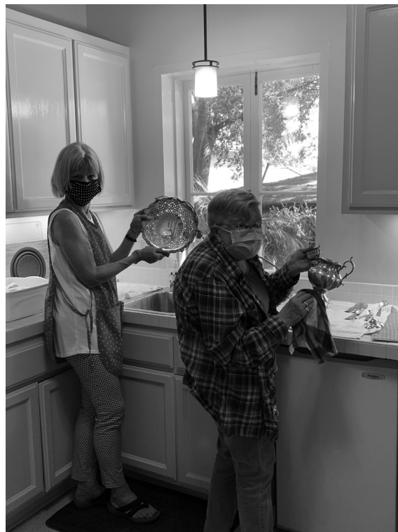
Lanternman volunteers have fun on the annual silver cleaning day!

The Lanterman House offers guided tours of the fully restored building, listed on the National Register of Historic Places. Tours are led by trained docents and last approximately 60 minutes. Self-guided tours are not available. All tours begin at the Visitor Center located inside the converted garage at the rear of the property. Visitors can also enjoy a preliminary history video in the Visitor Center.