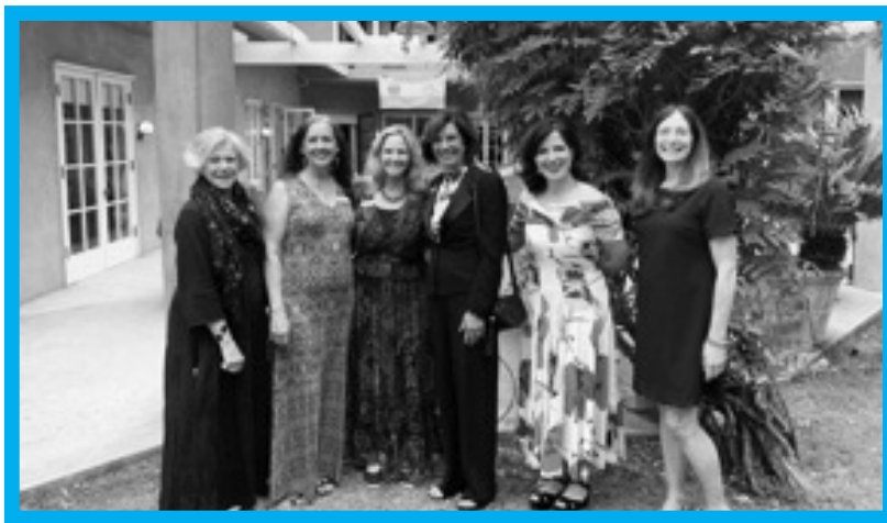
In May, La Cañada Flintridge Sister Cities Association hosted a cocktail party at the Lanterman House to honor the visiting delegation from Villanueva de la Cañada.