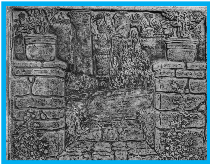
Center tile from the Batchelder fireplace.