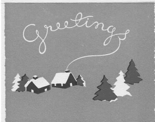
A holiday greeting card from the Lanterman Archives, circa 1940's