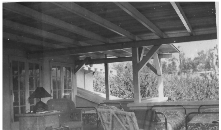
Sleeping porch on second story of Lanterman House, circa 1920.