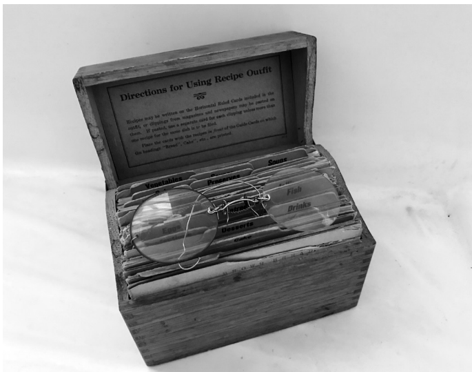
Emily's recipe box and glasses