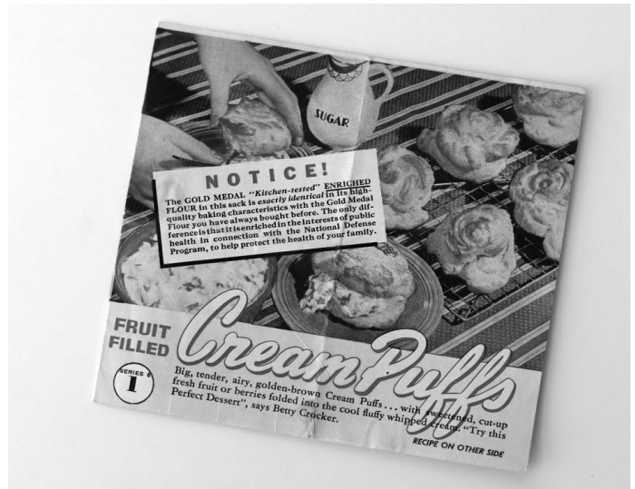
One of Emily's collection of recipes